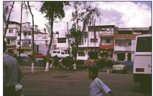
Fig. 1 The Market Place

Nowhere on Earth is the threat of biological impoverishment because of deforestation greater than in the Amazon Basin of South America. The Amazon supports approximately 300 million hectares of tropical forest, the largest single area of tropical forest communities in the world. Estimates of global biodiversity point to the