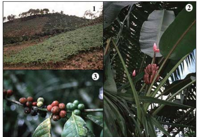
Fig. 6 (1) large coffee plantation, (2) banana tree, (3) coffee beans.

However, this value is probably a significant overestimate because it is based on a forest stand containing a high fraction of commercial species, and it does not account for declining prices as more goods are brought to markets (Southgate 1998). Intensive agroforestry programs that farm rapidly growing commercial trees or a mix of trees with crops, such as coffee, are gaining popularity (Grainger 1993, Southgate 1998). Grainger (1993) suggests that a commercial plantation of teak may produce 245m 3 of timber per hectare over a 65-year period. Gmelina may produce 150m 3 per hectare over a 10-year period. Assuming a tropical timber value of $20–35/m 3 , this style of production may