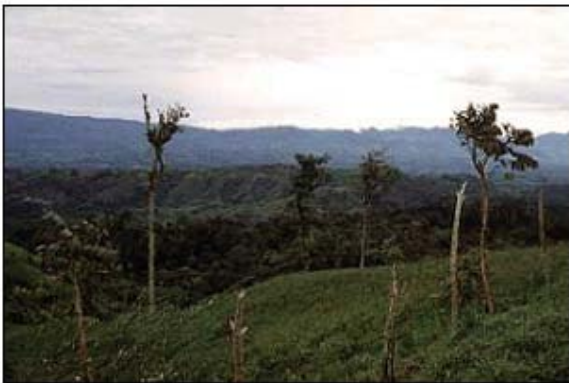
Fig. 5 Abandoned land following pasture degradation.

Even with a bounty of unclaimed natural forest, peasant farmers found it difficult to coexist with cattle ranchers in the Amazon. In addition to the problems of soil fertility, land grabbing followed the appropriation of the Amazon frontier, leading to many bloody clashes between cattle owners and peasant farmers. A recent estimate suggested that of the 4 million residents of the Amazon, 150,000 or 4%, are forcibly evicted from their land each year (Hall 1989). From the perspective of cattle ranching, it is cheaper to appropriate pasture by the forced removal of farmers than to clear forest. High–profile efforts to secure land rights for peasant farmers, including those by a group of