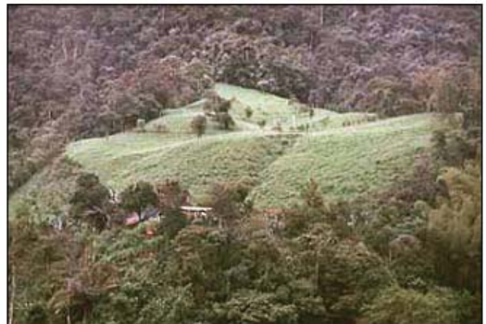
Fig. 3 Small clearing in primary tropical rainforest

These are some of the most hotly debated environmental questions today, leading to international conventions like the United Nations Convention on Biodiversity at the Rio de Janeiro “Earth Summit” in 1992.