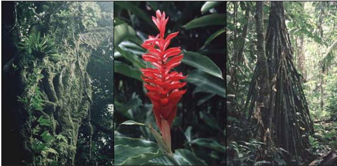
Fig. 2 Examples of wet tropical rainforest communities.

tropics as the source of 50 to 90% of all species on Earth (Wilson 1992); the richest forests often support over 300 tree species per hectare, approximately the same number of tree species in all of North America.